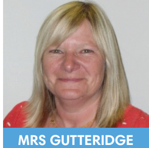
OUTREACH OFFICER/ DEPUTY DSL