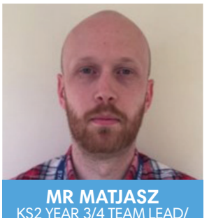
KS2 YEAR 3/4 TEAM LEAD/ DEPUTY DSL